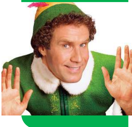
Who's Your Buddy will take place on Friday, March 20. Fun, fun, fun!

"It's amazing how much can be accomplished if no one cares who gets the credit." ~ John Wooden