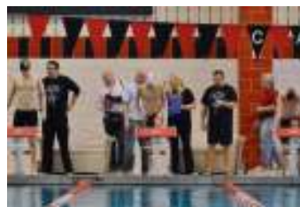
SEA will be well represented at WIAA State this weekend. The top heat of the IBr includes three of our Breaststrokers!

around the corner please don't forget we will go back to split pools beginning Tuesday. Refer to the updated